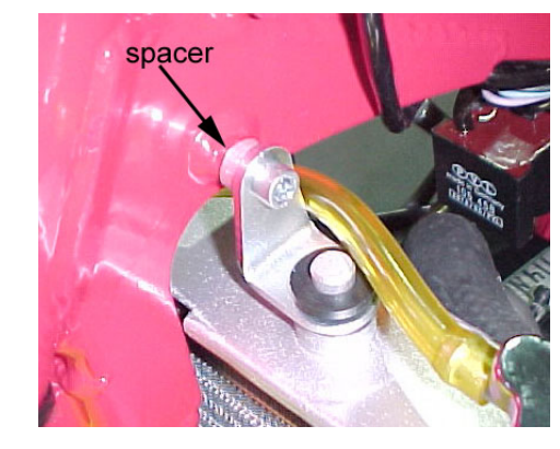
Figure A Figure B